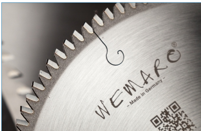
Sawblades HSS-E, carbide-tipped and PCD product categories 92000 bis 92061 for UPVC-, aluminium-, steel- and composite materials