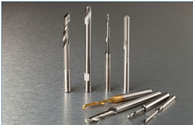
Milling Cutters HSS-E and tungsten-carbide product categories 91000 to 91155 for UPVC-, aluminium-, steel- and composite materials

WEMARO Tools are tested to the highest quality standards and are continually developed and improved.